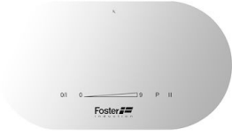
TOUCH CONTROL 4 FOYERS RONDS BLANC